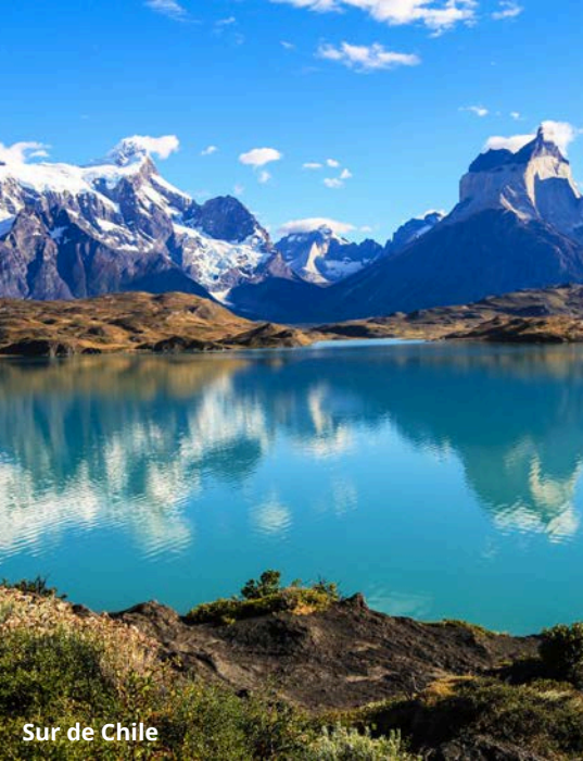
Sur de Chile