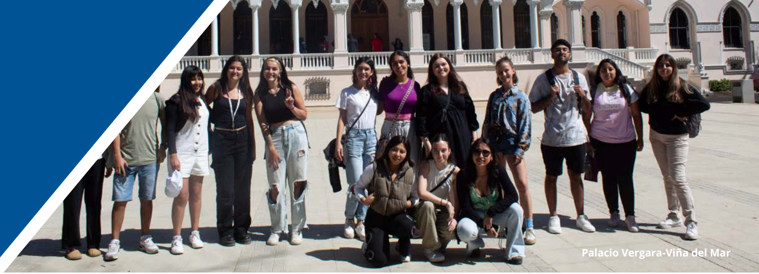
Palacio Vergara-Viña del Mar