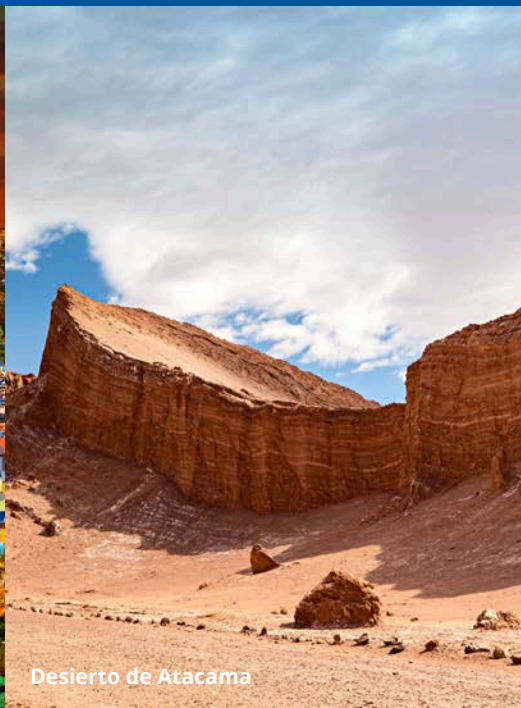
Desierto de Atacama