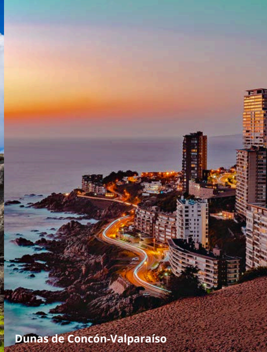
Dunas de Concón-Valparaíso