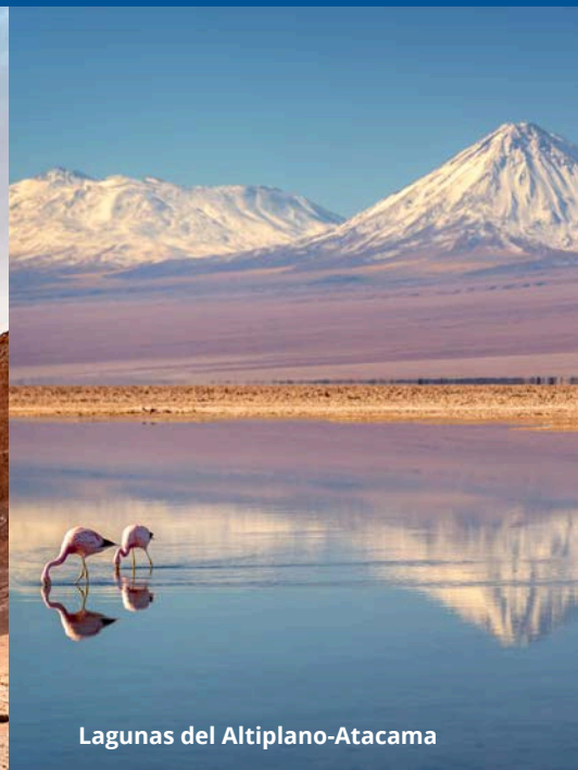
Lagunas del Altiplano-Atacama