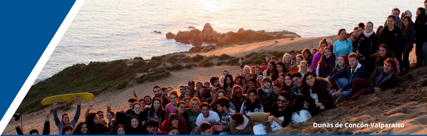
Dunas de Concón-Valparaíso