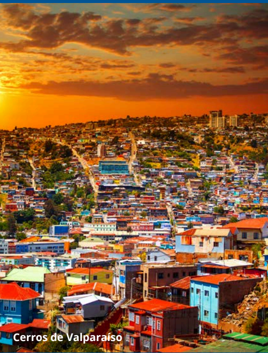
Cerros de Valparaíso